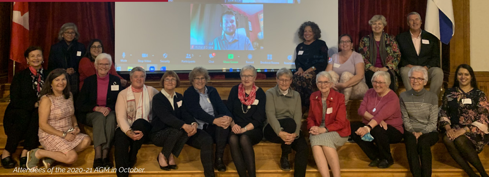
Attendees of the 2020-21 AGM in October.

As you may have read in some recent communication, the Alumnae & Alumni Association has decided to take a break, at least temporarily. At their October 20th AGM, alums met in person and joined online to present its last report and to take care of some final details, including where to direct their almost $10,000 in remaining funds which came from dues and fundraising events. The School gratefully accepted their gift to the Alum Bursary Fund where it will be invested and used to provide tuition assistance to students in need.