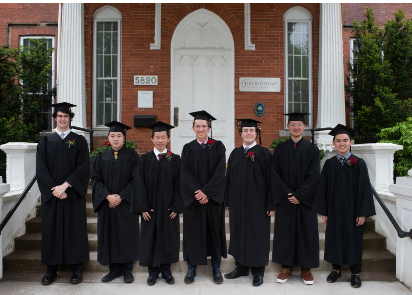
These photos were created using the magic of photoshop! The graduates were photographed individually and our talented Digital Coordinator Sofia Ortega made these wonderful composite photos.