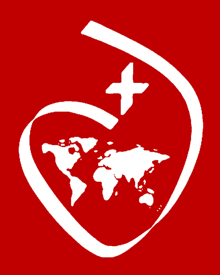
Conference of Sacred Heart Education